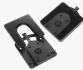
HP Quick Release Bracket 2

Use the HP Quick Release Bracket 2 to attach your HP Desktop Mini to an HP display 1 and a variety of stands, arms or wall mounts. 2 The failsafe "Sure-Lock" mechanism snaps the PC securely in place, and can be further secured with a theft-deterrent security screw.