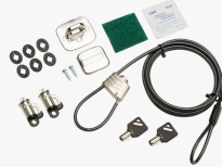
HP Business PC Security Lock v3 Kit

Help prevent chassis tampering and secure your PC and display in workspaces and public areas with the affordable HP Business PC Security Lock v3 Kit.