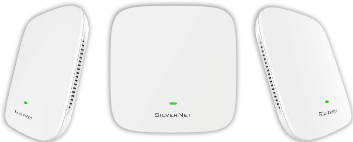
SIL WCAP-AX 1800Mbps 802.11AX Dual Band Wireless Ceiling AP

All New Robust Performance, Wireless Ceiling Access Point