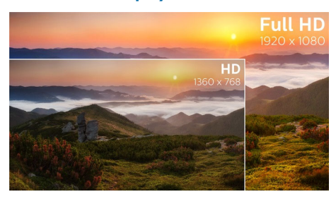
Picture quality matters. Regular displays deliver quality, but you expect more. This display features enhanced Full HD 1920 x 1080 resolution. With Full HD for crisp detail paired

with high brightness, incredible contrast and realistic colours, expect a true-to-life picture.