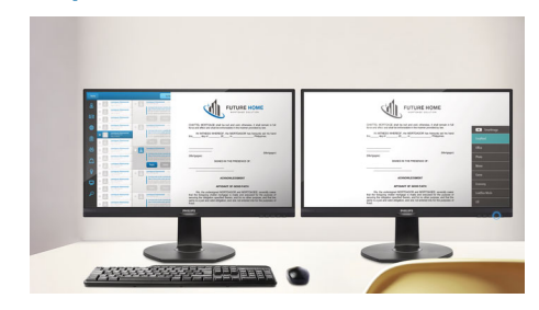
EasyRead mode for a paper-like reading