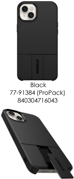
Black 77-91384 (ProPack) 840304716043