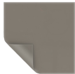
Da-Tex Half Angle: 30° Gain: 1.3