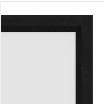
Pro-Trim Fabric (Standard)