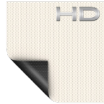
HD Progressive 1.1 Perf Half Angle: 85° Gain: 1.1