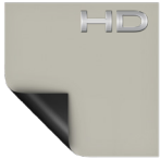
HD Progressive 0.6 Half Angle: 85° Gain: 0.6