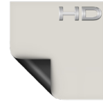
HD Progressive 1.1 Contrast Half Angle: 60° Gain: 1.1