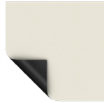
Da-Mat Half Angle: 60° Gain: 1.0