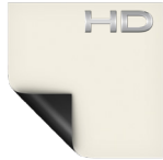
HD Progressive 0.9 Half Angle: 85° Gain: 0.9