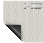
HD Progressive 1.1 Contrast Perf Half Angle: 60° Gain: 1.1