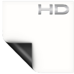
HD Progressive 1.3 Half Angle: 75° Gain: 1.3