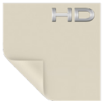
Dual Vision Half Angle: 65° Gain: 0.9