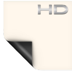
HD Progressive 1.1 Half Angle: 85° Gain: 1.1