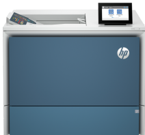
HP Color LaserJet Enterprise 6701dn Printer series

This printer is intended to work only with cartridges that have a new or reused HP chip, and it uses dynamic security measures to block cartridges using a non-HP chip. Periodic firmware updates will maintain the effectiveness of these measures and block cartridges that previously worked. A reused HP chip enables the use of reused, remanufactured, and refilled cartridges. More at: http://www.hp.com/learn/ds