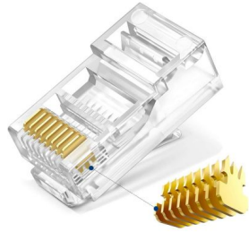
3 PRONG PINS GOLD PLATED 8P8C PINS ENSURE SECURE CONNECTIONS