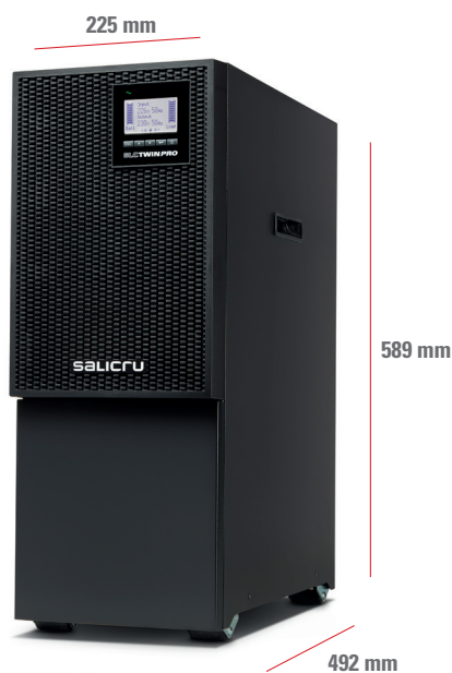
SLC 4000÷10000 TWIN PRO3