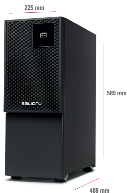
EBM - SLC TWIN PRO3