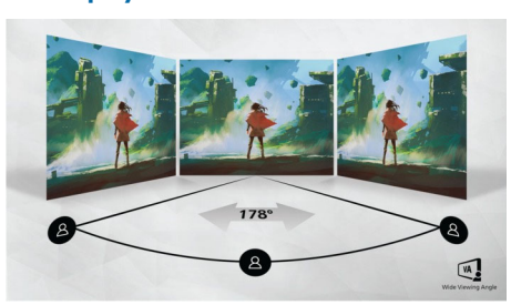
Philips VA LED display uses an advanced multidomain vertical alignment technology which

gives you super-high static contrast ratios for extra vivid and bright images. While standard office applications are handled with ease, it is especially suitable for photos, web-browsing, movies, gaming, and demanding graphical applications. It's optimized pixel management technology gives you 178/178 degree extra wide viewing angle, resulting in crisp images.