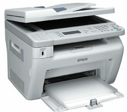
AL-MX14NF 1 model with print, copy, scan and fax functions