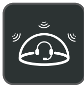
Acoustic Shield Technology