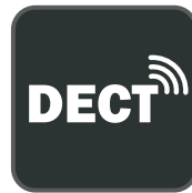
Long Wireless Range