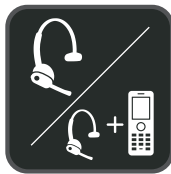
Stand-Alone and Paired Mode