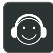
All Day Wearing Comfort