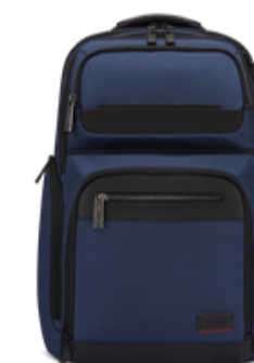
ThinkPad Executive 16" Backpack