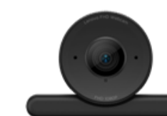
Lenovo FHD Webcam