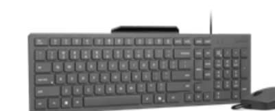
Lenovo 310 USB-A Wired Combo US Euro