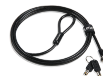
Kensington MicroSaver DS 2.0 Cable Lock from Lenovo