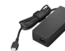
ThinkEdge 65W Wide Temperature AC Adapter(slim tip)-UK/Hong...