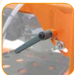
New adjustable cutting-depth handle.

Max. diameter 400 mm Max. bore 25,4 mm Tilting table (option - 510109260) 0° - 45° Max. cutting depth. at 90° 135 mm Max. cutting depth. at 45° 94 mm Max. cutting length 670 mm Max. material height 200 mm Table size 500 x 540 mm Tool speed RPM 2800 min -1 Hand Arm Vibrations < 2,5 m/s 2 Sound power / Pressure level 92 dB(A) / 80 dB(A)