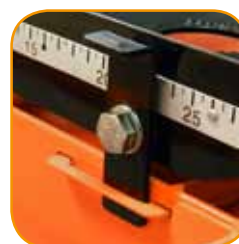
Conveyor cart locking system.