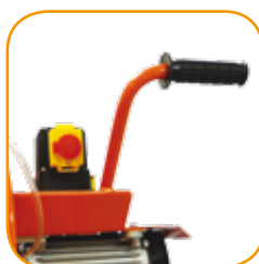
More comfortable handle shape.