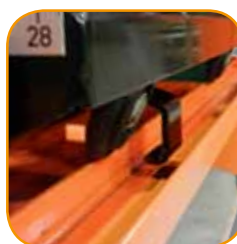
Wide conveyor cart with tilted wheels, anti-pivoting and locking system.