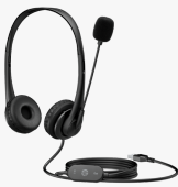
HP Stereo USB Headset G2 428H5AA