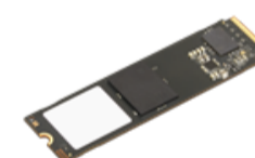
ThinkCentre 1TB Value PCIe Gen4 NVMe OPAL 2.0 M.2 2280 SSD 4XB1L68662