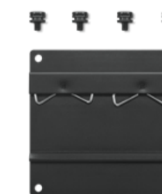
ThinkEdge SE50 DIN Rail Mount 4XF1C98168