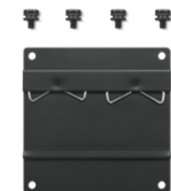
ThinkEdge SE50 DIN Rail Mount 4XF1C98168