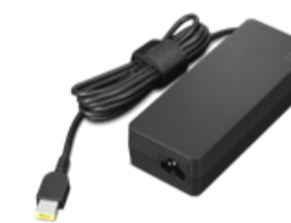
ThinkEdge 65W Wide Temperature AC Adapter(slim tip)-UK/Hong... 4X21J08880