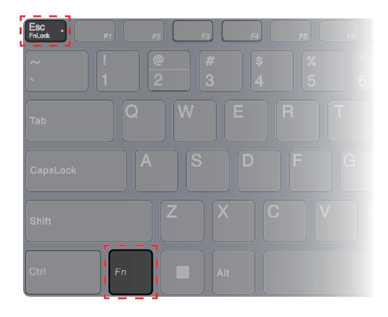
Figure 2. Locations of the FnLock key and the Fn key

A Lenovo keyboard usually contains hotkeys in the top row. These hotkeys share keys with the function keys (F1–F12) and other keys. For these dual-function keys, the icons or characters denoting the primary functions are printed on top of the icons and characters denoting the secondary functions.