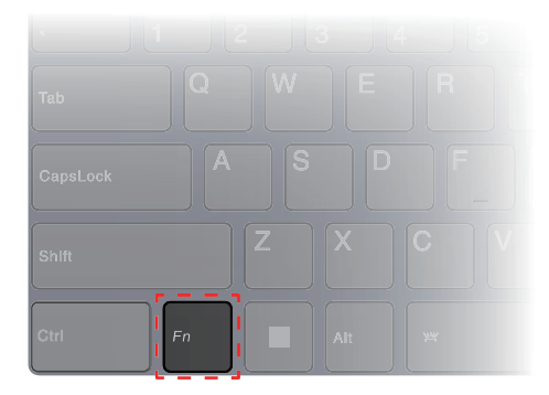
Figure 1. Location of the Fn key

Note: The FnLock switch does not apply to hotkeys not found in the first row of the keyboard. To use these hotkeys, always hold down the Fn key while pressing the key.