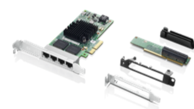
Lenovo Intel I350-T4 4-Port Ethernet Expansion Card