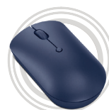
Lenovo 540 USB-C Wireless Mouse