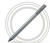
Lenovo USI Pen