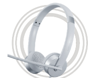
Lenovo J10 Stereo USB Headset