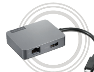
Lenovo USB-C Travel Hub Gen 2