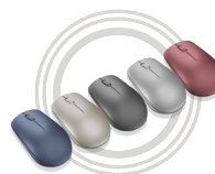
Lenovo 530 Wireless Mouse