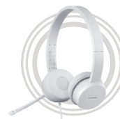
Lenovo 110 USB Stereo Headset