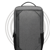
Lenovo 15.6" Laptop Urban Backpack B530