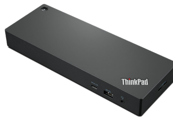
ThinkPad® Workstation Thunderbolt™ 4 Dock