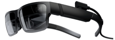
ThinkReality® A3 XR1 3G+32G