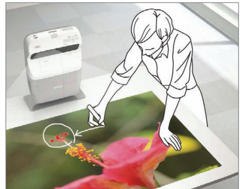
Project onto any horizontal surface such as a tabletop