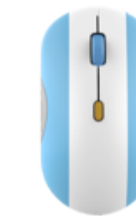
Lenovo 350 Bluetooth Silent Mouse (Fan Edition - Argentina)