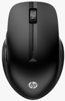
HP 430 Multi-Device Wireless Mouse 3B4Q2AA