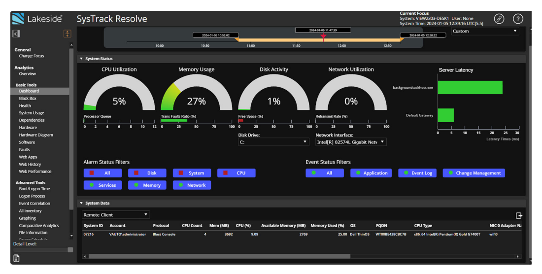
Figure 2. Lakeside Virtual Agent Dashboard