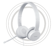
Lenovo 110 USB Stereo Headset