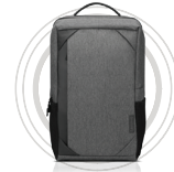
Lenovo 15.6" Laptop Urban Backpack B530