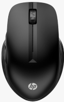
HP 430 Multi-Device Wireless Mouse 3B4Q2AA