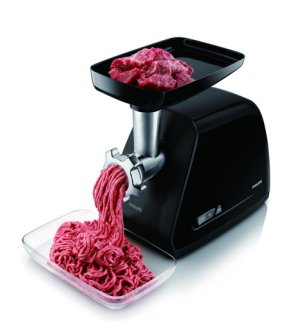
Up to 2.7 kgs/min

Mincing capacity up to 2.7 kgs in 1 minute.