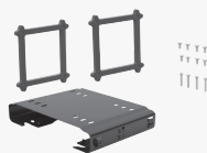
HP Desktop Mini v4+ VESA Sleeve

Wrap your HP Desktop Mini PC in the HP Desktop Mini v4+ VESA Sleeve to securely mount it—with or without an Expansion Module 1,2 —behind your display, position the solution on a wall, and lock it down with the integrated security bracket and optional HP Ultra-Slim Cable Lock.