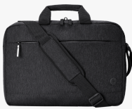
HP Prelude Pro 17.3-inch Laptop Bag 3E2P1AA