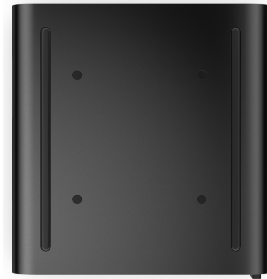
HP Z2 G9 Mini Workstation Desktop PC, bottom view

Removable VESA cap for access to integrated VESA mounting holes