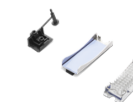
ThinkCentre M.2 2280 SSD Kit III