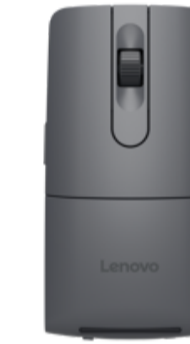
ThinkPad Bluetooth Presenter Mouse (Aura Edition)