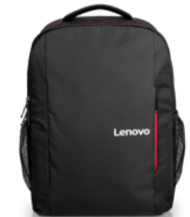
Lenovo 16" Laptop Everyday Backpack B510