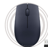
Lenovo 520 Wireless Mouse