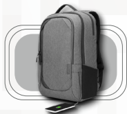
Lenovo 17" Laptop Casual Backpack B730