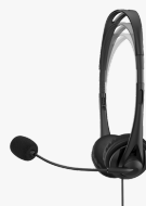
HP Stereo 3.5mm Headset G2 428H6AA