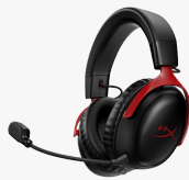
HyperX Cloud III Wireless - Gaming Headset 77Z46AA