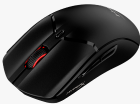
HyperX Pulsefire Haste 2 - Wireless Gaming Mouse (Black) 6N0B0AA