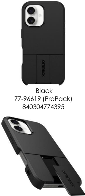
Black 77-96619 (ProPack) 840304774395