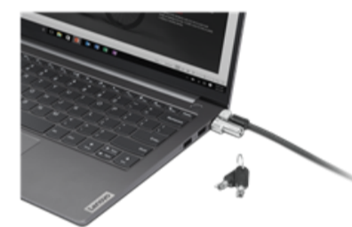
NanoSaver Cable Lock from Lenovo