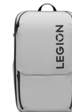
Lenovo Legion 17" Gaming Backpack GB800 (Light Gray)