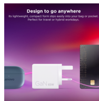
Lenovo Dual USB-C 65W GaN Charger