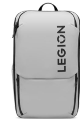
Lenovo Legion 17" Gaming Backpack GB800 (Light Gray)