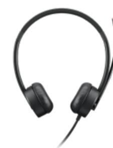
Lenovo Essential Stereo Analog Headset