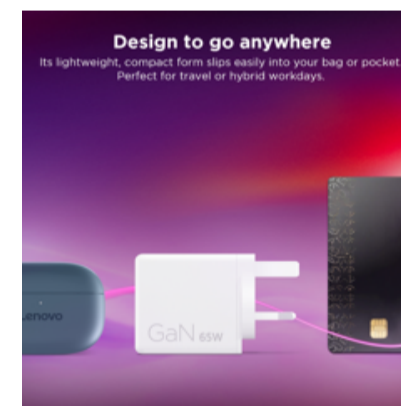
Lenovo Dual USB-C 65W GaN Charger