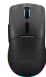
Lenovo Legion M220 Wireless RGB Gaming Mouse (Eclipse Black)