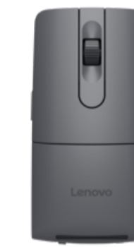
ThinkPad Bluetooth Presenter Mouse (Aura Edition)