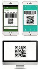
Codes on PC screen