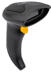
Image CMOS Scanning