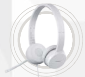
Lenovo 110 USB Stereo Headset