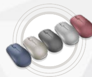
Lenovo 530 Wireless Mouse