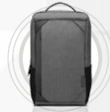
Lenovo 15.6" Laptop Urban Backpack B530