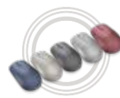
Lenovo 530 Wireless Mouse