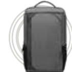
Lenovo 15.6" Laptop Urban Backpack B530