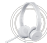
Lenovo 110 USB Stereo Headset