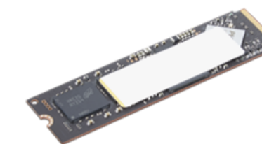
ThinkPad 2TB Performance PCIe Gen4 NVMe OPAL2 M.2 2280 SSD IV