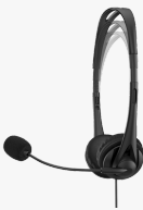
HP Stereo 3.5mm Headset G2 428H6AA