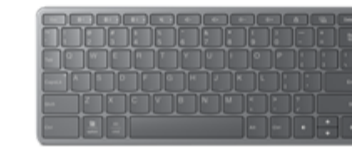
Lenovo Multi-Device Wireless Keyboard