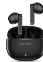
Lenovo E310 True Wireless Stereo Earbuds (Black)